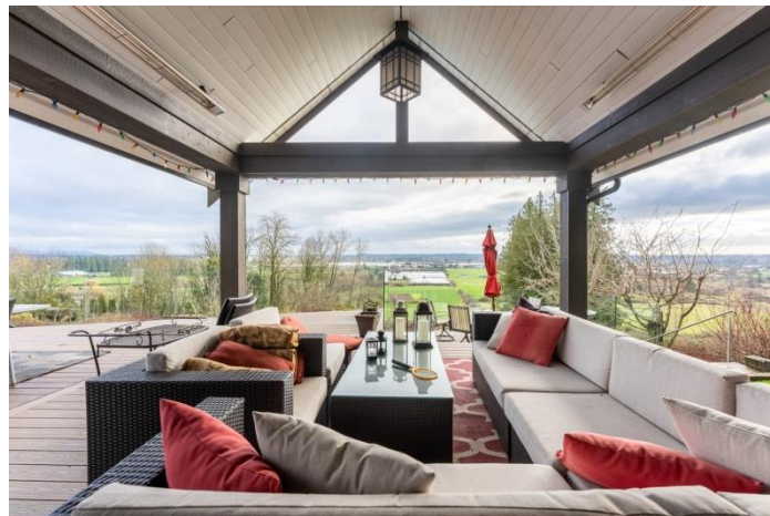
Family Room: 18'4 x 14'10