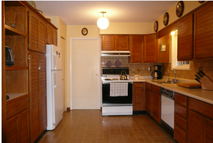
Family Room – 16’ x 13.5’ - Spacious family room/office with exterior access will facilitate your casual entertaining or computer or home business needs.