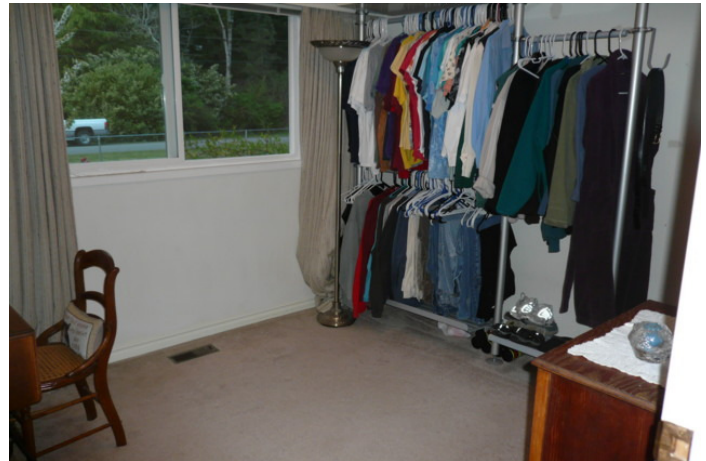
Bedroom – 9.5' x 9'