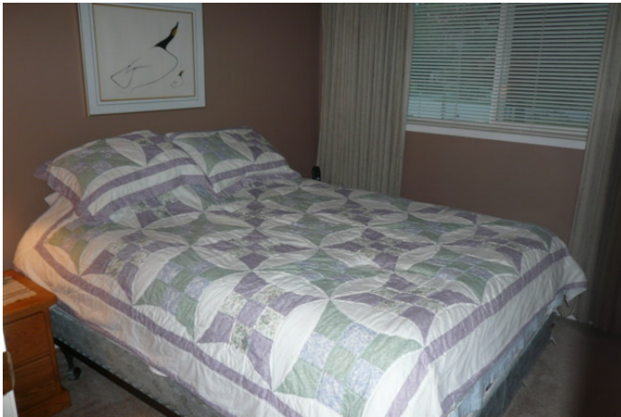
Bedroom – 10.25' x 9'