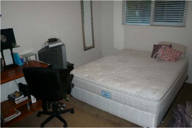
Bedroom - 13' x 9'