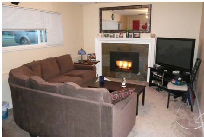
Other - 12' x 8'