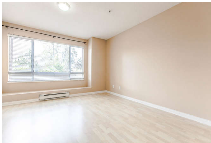
3 Piece Main Bath: