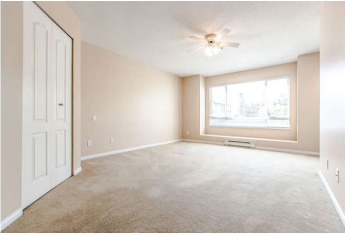
Master Bedroom: 18'8 x 12'2