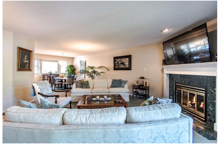
Dining Room: 15'11 x 11'8