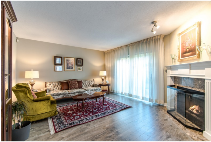
Living Room: 15'3 x 13'6