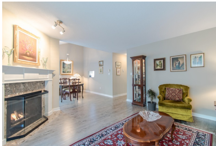
Dining Room: 11'6 x 9'11