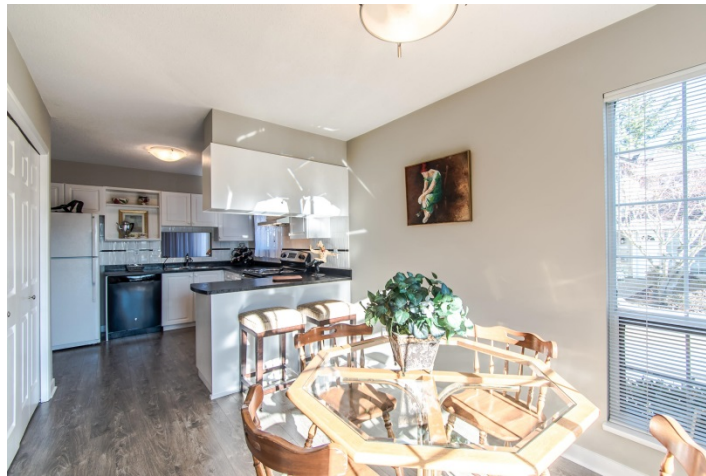
Family Room: 11'11 x 11'10