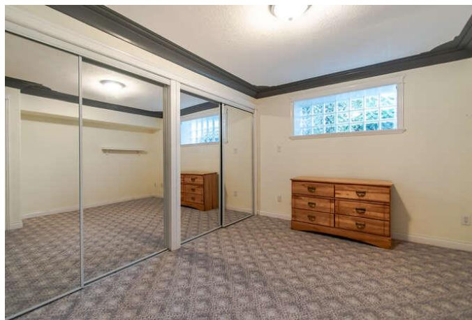
Flex Space: 9'11 x 6'3