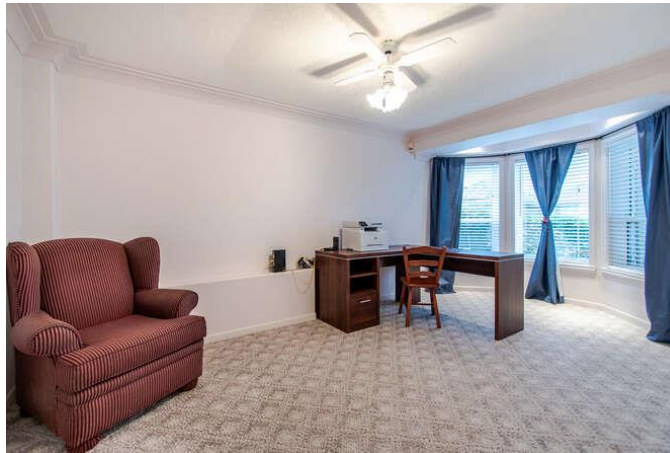
Bedroom: 12'11 x 10'11