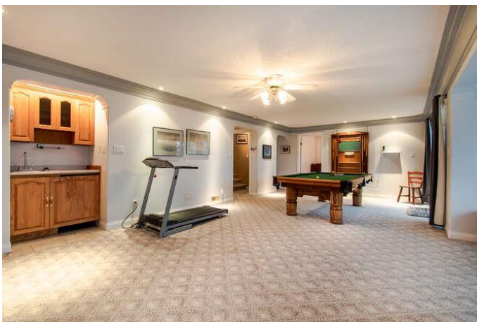
Recreation Room: 28'2 x 13'6 (Fireplace cannot be used)