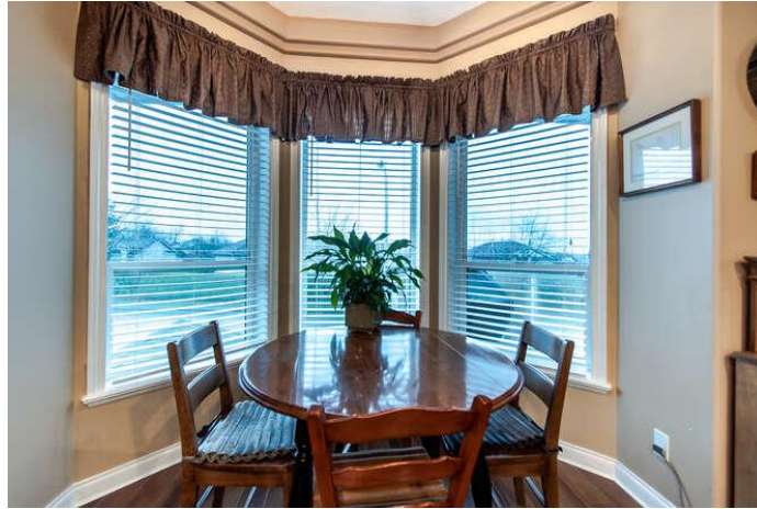
Family Room: 14'9 x 11'6