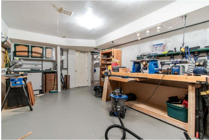
Workshop: 21'9 x 14'3 (unfinished)