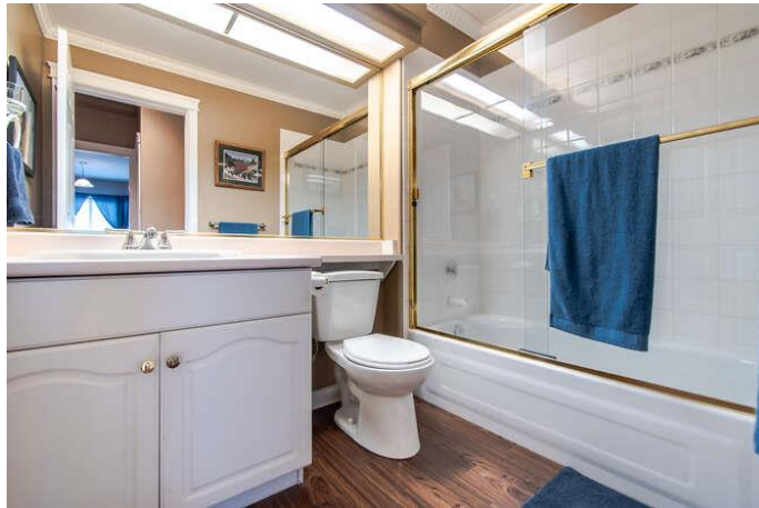
Master Bedroom: 18'5 x 11'3