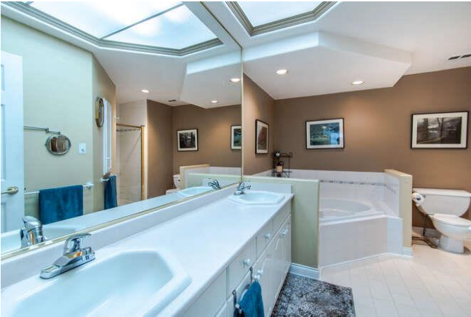
Master Ensuite: 13'4 x 12'7