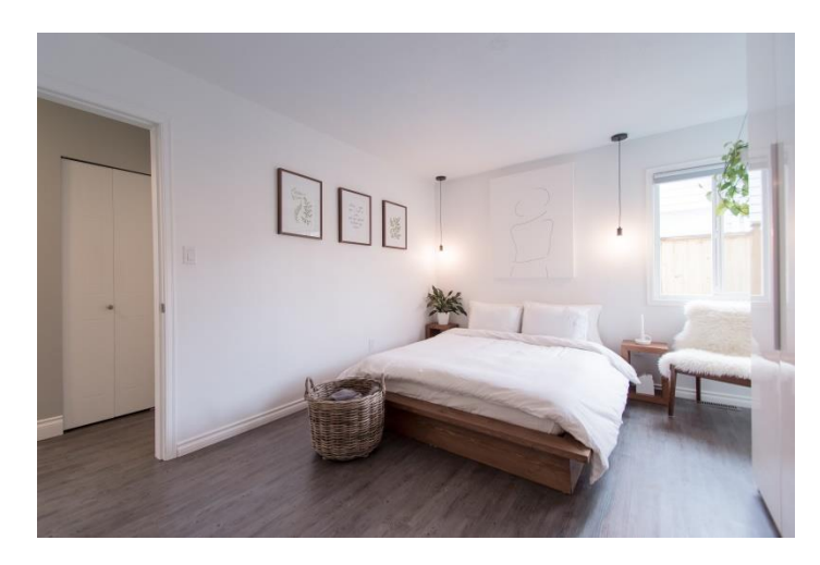
2 Piece Ensuite