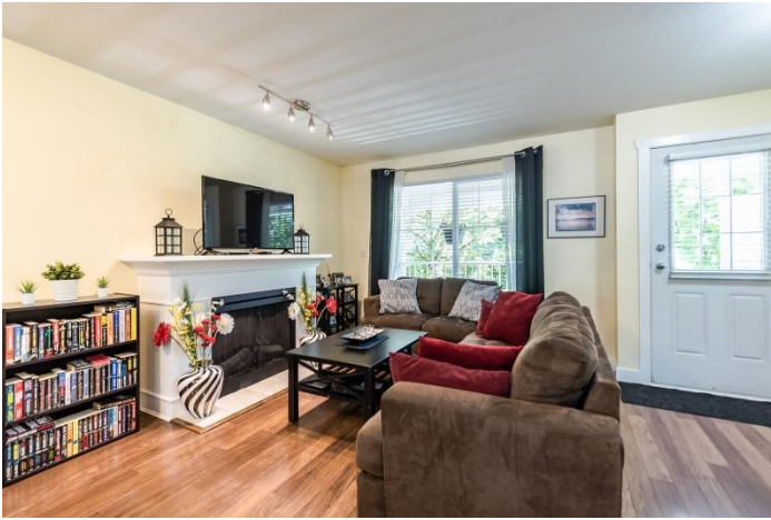
Living Room: 10'8 x 10'7