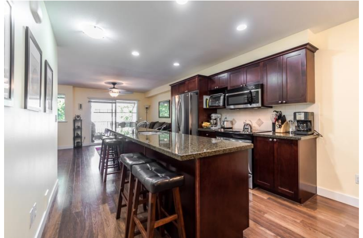
Family Room: 14'7" x 11'3"