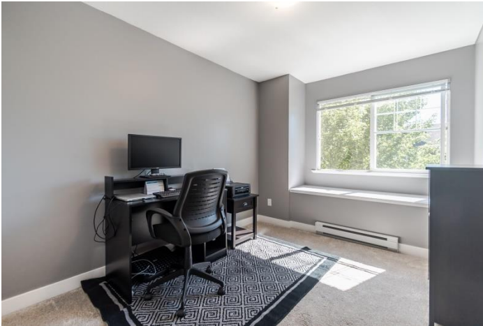
Bedroom: 10'4 x 9'1