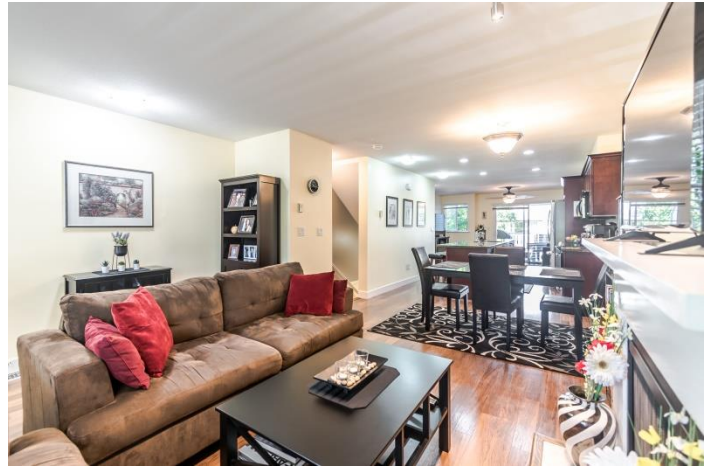
Dining Room: 11' x 8'7