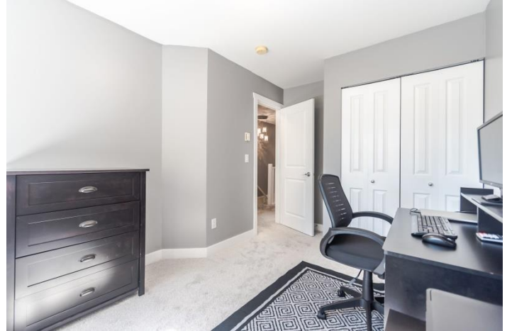
Bedroom: 9'6 x 9'1