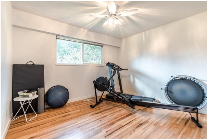
Bedroom: 11'11 x 10'