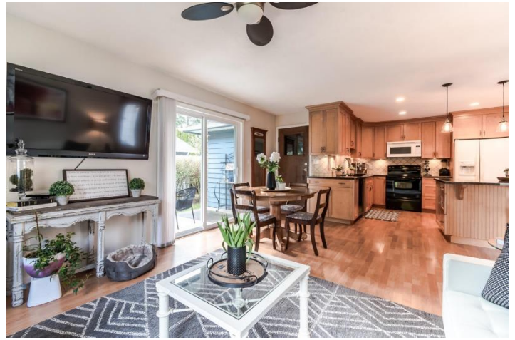
Kitchen: 17'8 x 10'6 + Eating Area