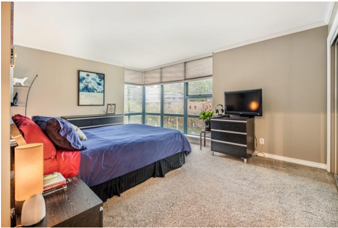
Primary Bedroom With His and Her Closets With Closet Organizer: 15'9 x 11'4