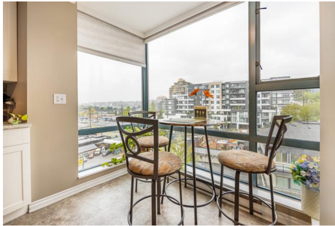
Family Room/Den: 11'4 x 8'7