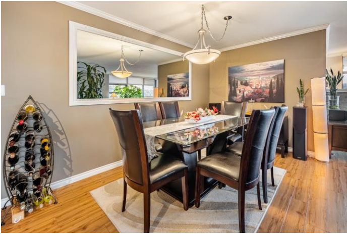
Dining Room – 17'11 x 10'