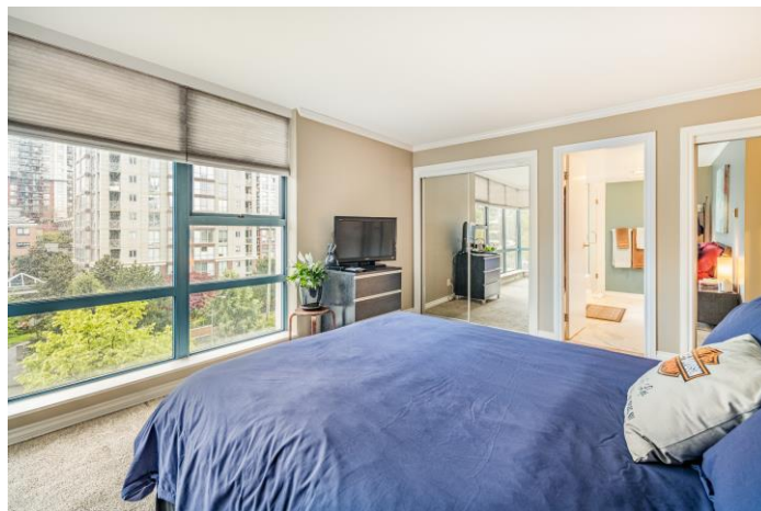
Updated 5 Piece Ensuite