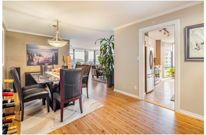
Kitchen: 10'9 x 8'11